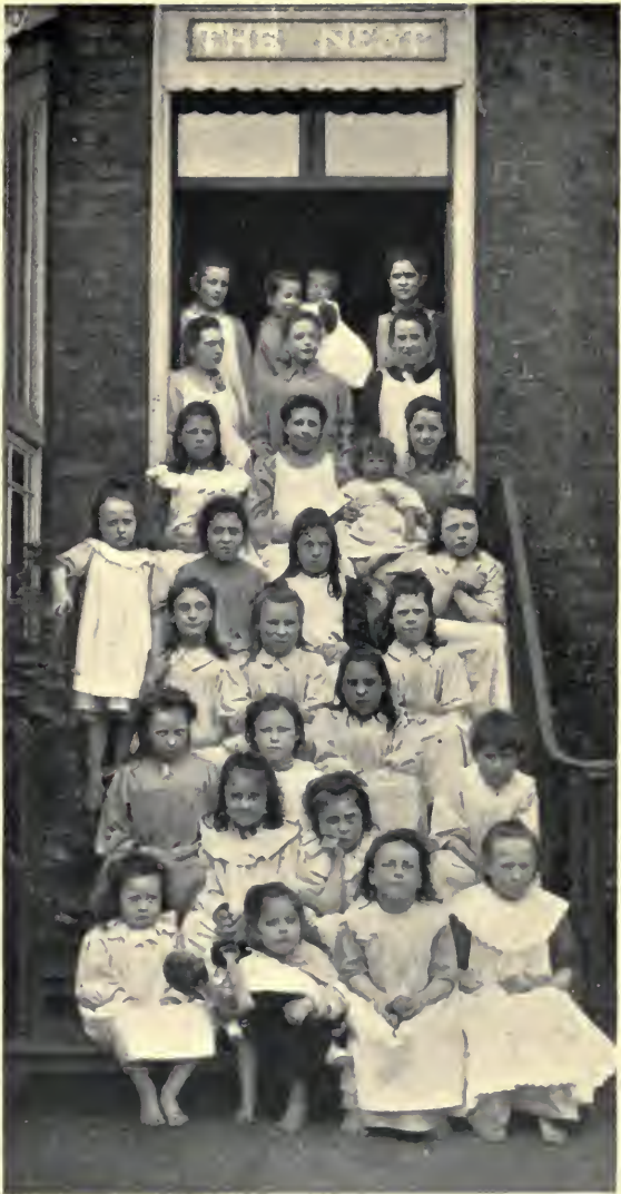
SOME OF THE CHILDREN AT 'THE NEST'